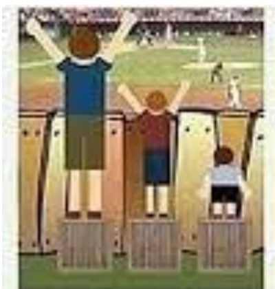
In the first image, it is assumed that everyone will benefit from the same supports. They are being treated equally.