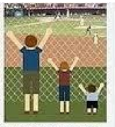
In the third image, all three can see the game without any supports or accommodations because the cause of the inequity was addressed. The systemic barrier has been removed.