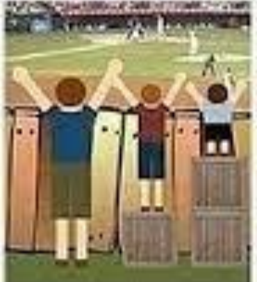
In the second image, individuals are given different supports to make it possible for them to have equal access to the game. They are being treated equitably.